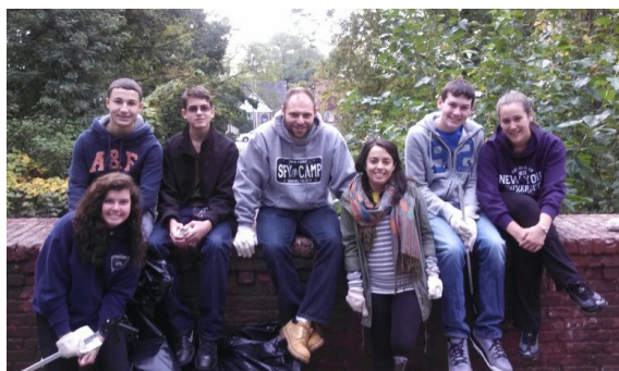
Hardworking volunteers from the Samuel Field Y Youth Group